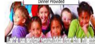
Let's us enjoy your kids for the night!

Hosted by Cats for Christ Friday, February 10 th 6-10 PM at the church building Dinner Provided